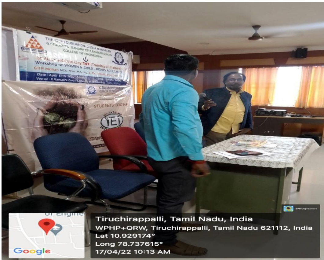
The 1234-Foundation-Chola mandalam in association with Students' Exnora organised TOT(Training of Trainers) on 17/4/22.