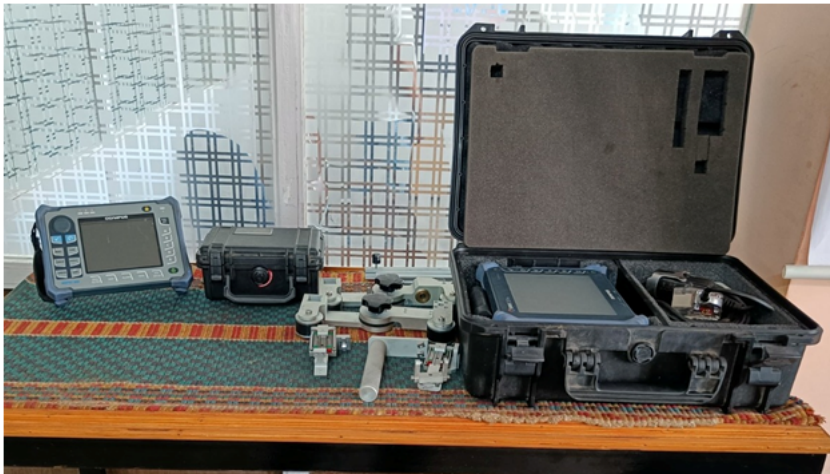
Figure 7.6 Snapshot of Industry Sponsored Testing Laboratory