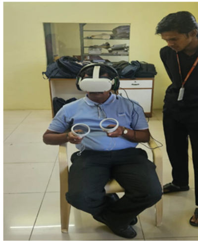
Figure 7.4 Snapshot of AR & VR Laboratory

The AR/VR Laboratory in Mechanical Engineering is a state-of-the-art facility designed to integrate Augmented Reality (AR) and Virtual Reality (VR) technologies into engineering education and research. It enables immersive visualization of complex mechanical systems, virtual prototyping, and simulation of manufacturing processes. Students can interact with 3D models of engines, machines, and structures, enhancing their understanding of design and functionality. The lab supports curriculum development, advanced research, and industry collaborations in areas such as digital twins, product design, and maintenance training. It bridges the gap between theoretical knowledge and real-world application through experiential learning and interactive technology.