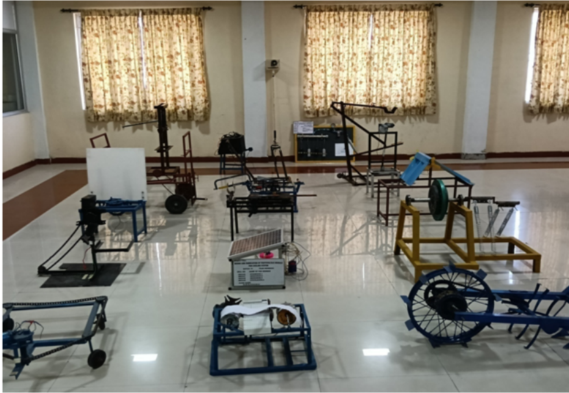
Figure: 7. 8 Snapshot of Project Laboratory