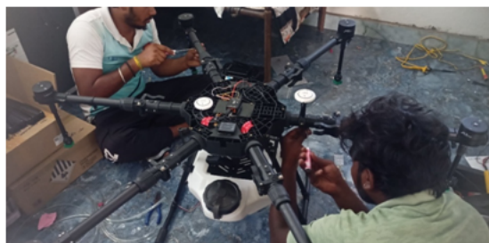
Figure 7.7 Snapshot of Automation Laboratory

The Drone Laboratory for Mechanical Engineering focuses on the design, development, and testing of unmanned aerial vehicles (UAVs). It integrates aerodynamics, propulsion, control systems, and materials science to create advanced drones. Students and researchers explore innovative solutions in flight performance, structural integrity, and autonomous capabilities.